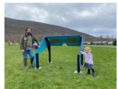
Patrons with Giant Eclipse Glasses from RMSC